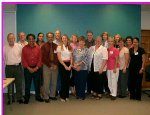
The Brisbane Team stop for a quick photo during one of their training sessions last month (pictured above).